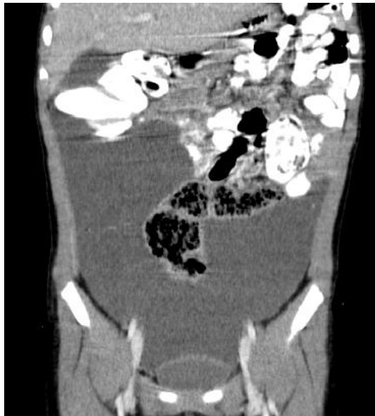
Figure 1: Coronal reconstructed CT image demonstrates large cystic mass lesion surrounded sigmoid colon, and displaced small bowel loops and ascending colon upwardly