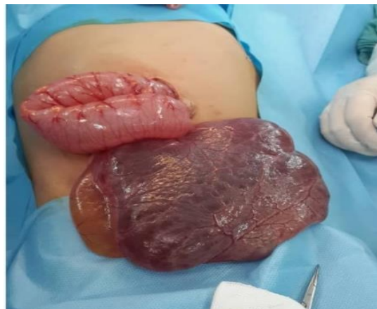
Figure 3: The huge abdominal cystic mass of the patients that was excised completely

For further examination, a computed tomography (CT) scan was recommended. In the abdominopelvic CT scan performed with an intravenous contrast, a huge cystic mass with approximately 150×140×50 mm in diameter on the right side of the abdomen was observed (Figures 1, 2). Its upper border extended to the lower margin of the liver and the lower extension to the pelvis and adjacent to the bladder. The mass displaced the small intestine and colon to the left side of the abdominal cavity, and it seems to be an intraperitoneal mass. However, due to the mass size, it was impossible to distinguish precisely the retroperitoneal or intraperitoneal masses. The mass contains fine and tiny septa. The suggested differential diagnosis included lymphangiomas, cystic teratomas, and cystic lesions, originated from the adnexa and cystic lesions from the source of peritoneum, as well as infectious cysts (hydatid cyst).