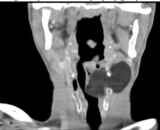
Figure 3: Reconstructed coronal lung window image

of the submucosal mass was performed. Pathology examination revealed an eight-centimeter