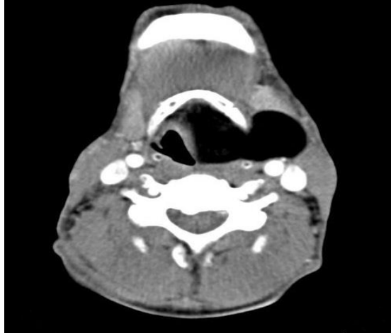
Figure 1: Axial soft tissue window image shows homogenous hypodense mass lesion in the left supraglottic area, extending to parapharyngeal space resembling a large laryngocele