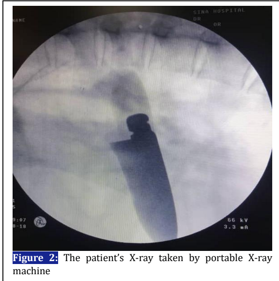
Figure 2: The patient's X-ray taken by portable X-ray machine

protocol which revealed possible pneumothorax, but no sign of hemothorax was observed. There was no abdominal free fluid and we did not detect any sign of pericardial effusion. The knife at the injury site did not allow performing anterior-posterior Chest X-Ray (CXR), therefore, a hemi-lateral CXR was taken to evaluate the extension of the injury. The radiograph was taken using a portable X-ray machine (Figure 2).