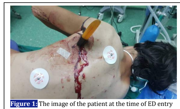
Figure 1: The image of the patient at the time of ED entry

thoracic cavity from lateral to the left mid-clavicle line posteriorly at the level of the third intercostal space with about 4 cm of the blade inside the body (Figure 1). Hematoma was detected at the site of the injury. Despite an elevated pulse rate (110 bpm), the patient was stable with the arterial blood pressure of 110/70 mmHg, respiratory rate of 18 and oxygen saturation of 96% in room air. We evaluated the patient by extended focused assessment with sonography in trauma (e-FAST)